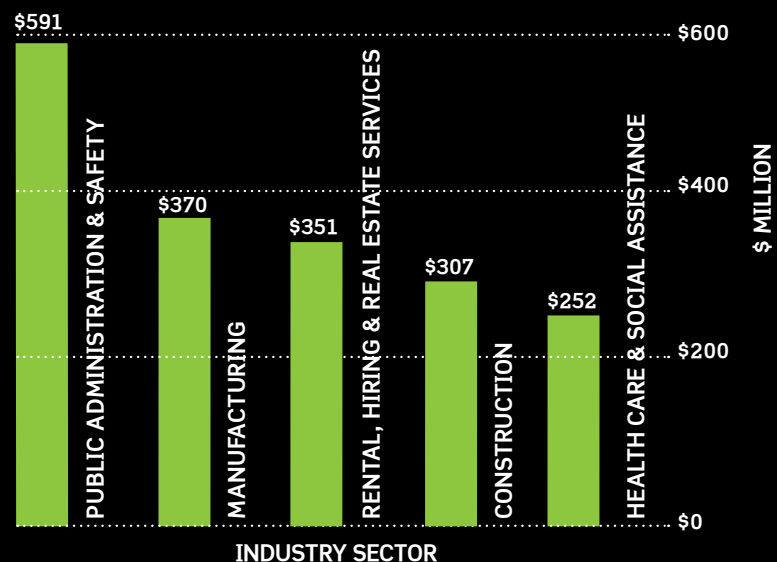
Top five industry sectors - value added - Wodonga

Exports from Wodonga are $2.62 billion annually.