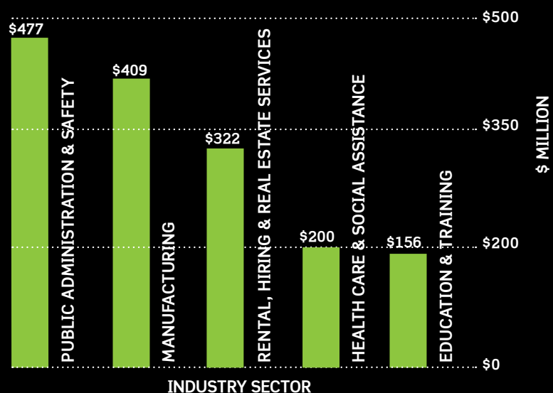
Top five industry sectors - value added - Wodonga

Exports from Wodonga are $2.59 billion annually.